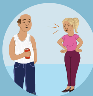
Lack of respect