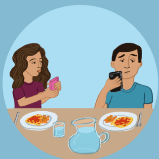
Lack of communication